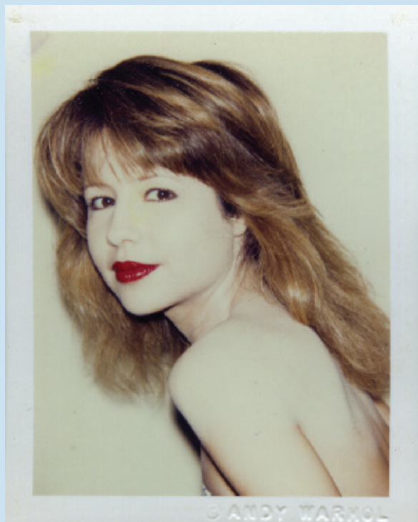
Andy Warhol (U.S.A., 1928–1987), Pia Zadora, 1983. Polacolor ER print. Cantor Arts Center, Gift of The Andy Warhol Foundation for the Visual Arts, 2008.80