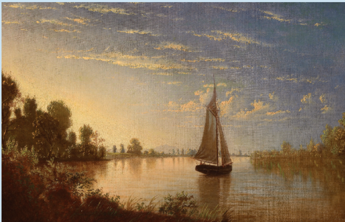
ABOVE: Fortunato Arriola (U.S.A., 1827–1872), Sunset on the Sacramento River , 1869. Oil on canvas. Cantor Arts Center, Museum purchase made possible by the Burt and Marion Avery Fund, 2008.4